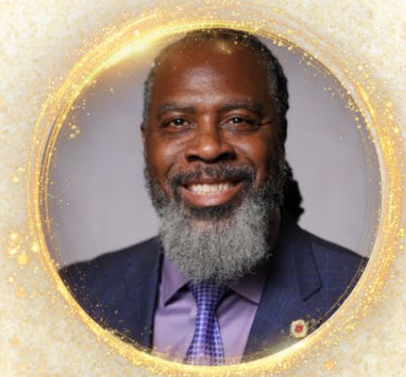
Co-Founder US Army Retired Warrant Officer