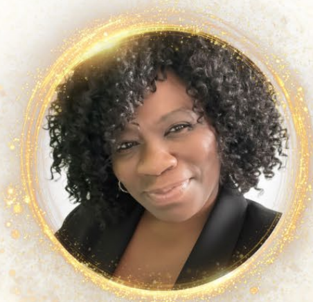
Founder/Visionary Community Leader | Consultant | Proud Army Spouse